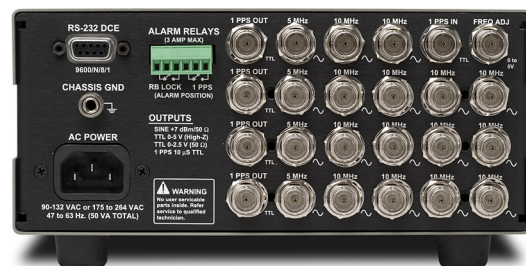
FS725 rear panel (with Opt. 03)