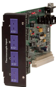
PTC330 Thermocouple Card