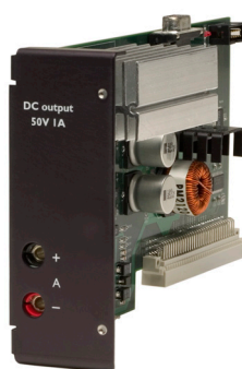
PTC430 DC Output Card

isothermal block, with its own RTD temperature sensor, provides highly accurate cold junction measurements.