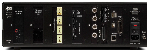
PTC10 rear panel

Macros are a powerful tool that can be used to tailor the behavior of the PTC10 for your experiment. For example, infinite-loop macros running as background tasks can take steps to address alarm conditions, automatically switch between sensor inputs (or heater outputs) depending on the current temperature or other factors, or implement cascade feedback schemes.