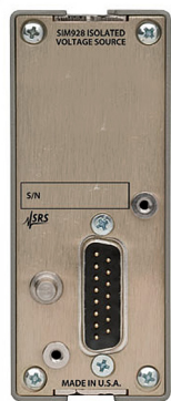
SIM928 rear panel